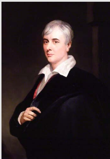
Image: George Borrow replica by Henry Wyndham Phillips (1843) National Portrait Gallery 1841